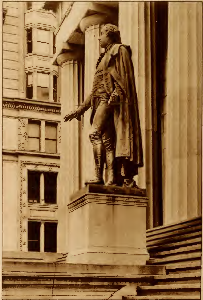
STATUE OF GEORGE WASHINGTON, in front of Sub-Treasury Building, in Wall Street.